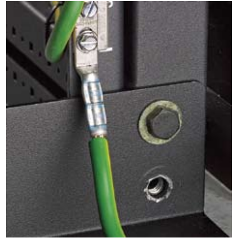
Figure 3. Grounding washers can be used to create electrical continuity in racks and cabinets. In this photo a bolt and washer is removed, showing paint removal from the contact area (bottom right).

In larger installations, the number of lug mounting locations on the busbar and the management of the grounding cables present a more complicated bonding situation. Under these circumstances the installer should run a continuous TEBC from the TGB down each row of racks, making a bond from the TEBC to each rack. These jumpers should be bonded to the TEBC using compression HTAP connectors, and bonded to the rack using a two-hole compression lug. The use of this lug at the rack is quite important, as this is a series circuit (where only one connection is made between rack and TEBC) and a two-hole compression lug will maintain the reliability of the connection at the same level as connections to the TGB. Compression connectors are required by many grounding standards and specifica-