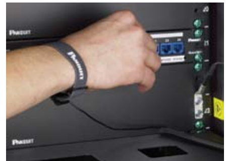
Figure 4. ESD wrist straps and ports enhance equipment protection.

tions because the connector barrel will not loosen from the conductor over time.